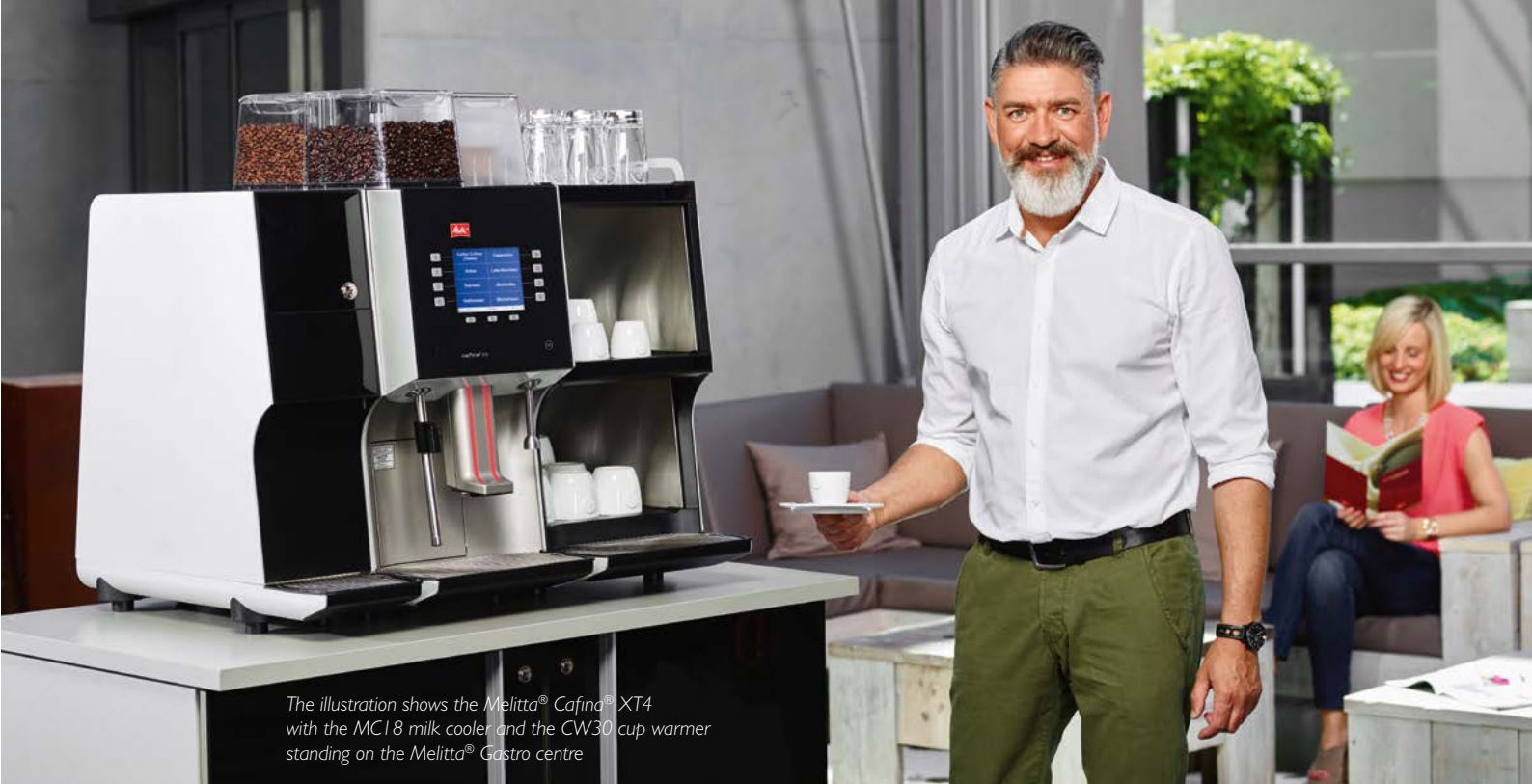
The illustration shows the Melitta® Cafina® XT4 with the MCI 8 milk cooler and the CW30 cup warmer standing on the Melitta® Gastro centre